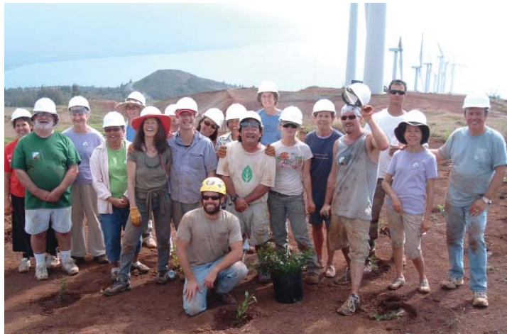
Weed & Pot Club outplanting at Kaheawa Wind Farm