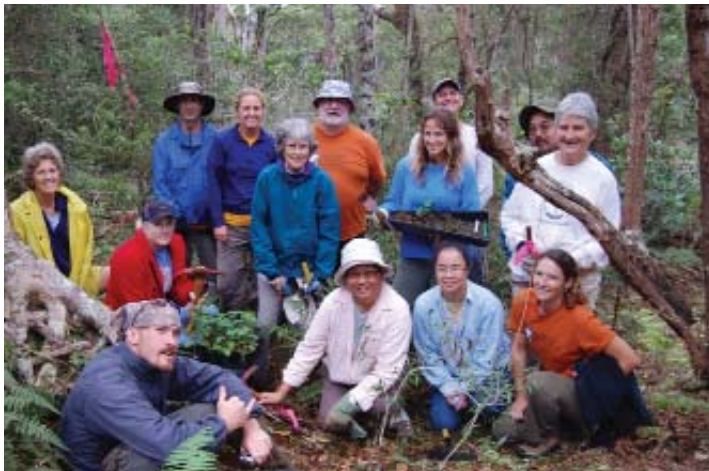
Endangered mint outplanting at Waikamoi Preserve with the Nature Conservancy