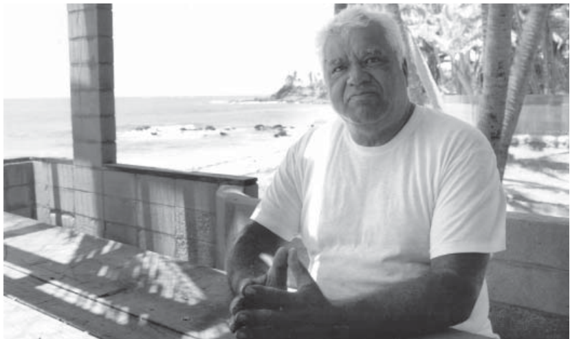
January 27, 1929-December 27, 2008